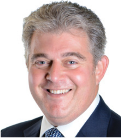
Rt Hon Brandon Lewis MP Minister of State for Policing and the Fire Service

The UK has a proud history as well as a strong track record of innovation. In recent years we have significantly reduced the number of people who die or are injured in fires, and this is a record of which we are very proud. We have also faced some significant environmental challenges, including flooding, major transport accidents, as well as major fires. Our focus on improving resilience and ensuring safety is designed into both our heritage as well as innovative buildings at the earliest stage and has directly contributed to our success.